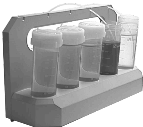
Rack for reagents bottles

With a special software, different spraying methods can be created, saved and loaded.